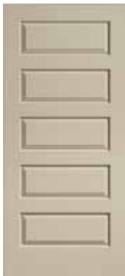
5-Panel 6'8" Only