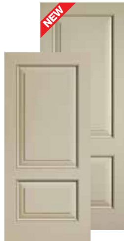
2-Panel Square Top 6'8" and 8'0"