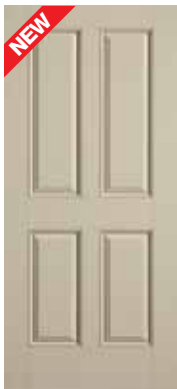
4-Panel Square Top 6'8" Only