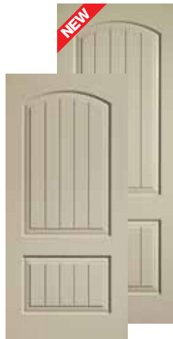
2-Panel Plank Soft Arch 6'8" and 8'0"