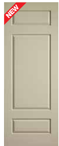
3-Panel 8'0" Only