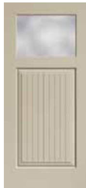
1-Panel Plank Craftsman 6'8" Only