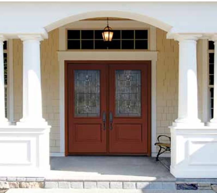
Image: Classic-Craft Canvas Collection, Lucerna Glass, Doors – CCV22022

1-800-THERMA-TRU (843-7628) 1750 Indian Wood Circle Maumee, OH 43537