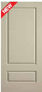
2-Panel 3/4 Top 6'8" Only