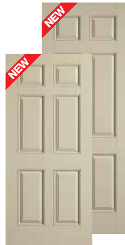
6-Panel 6'8" and 8'0"