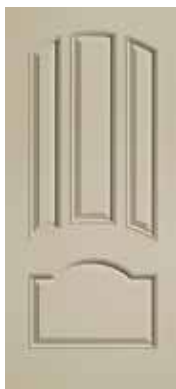
4-Panel Arch Top 6'8" Only