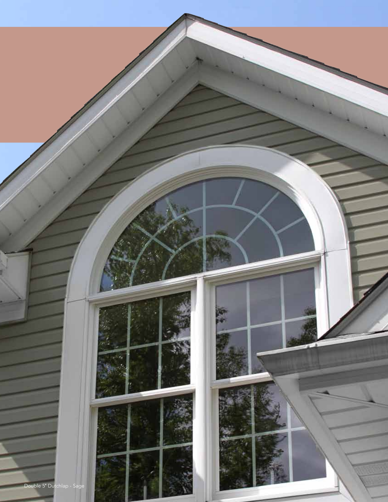
Double 5" Dutchlap - Sage